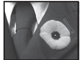
WEAR A POPPY

Contact Dolores 736-8924 - weather permitting.