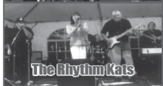
The Rhythm Kats