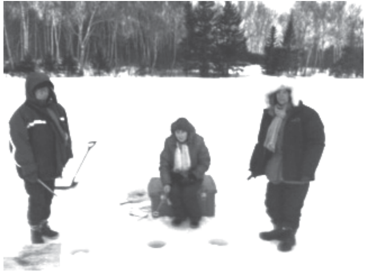
The "TWISTED SISTERS" GO SMELT FISHING - This picture was taken at Irish Vale on the weekend and it shows that the ice was still over a foot thick and the smelts "was runnin".